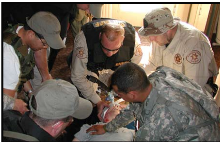
Field treatment of eye injuries brings to mind the physicians admonition to "first, do no harm." Most eye injuries are best stabilized and treated in a proper medical facility.

Treating and protecting eyes for those on the beat and in the sand box.